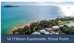
14 O'Brien Esplanade, Shoal Point