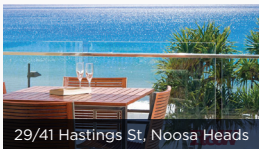
29/41 Hastings St, Noosa Heads