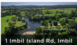
1 Imbil Island Rd, Imbil